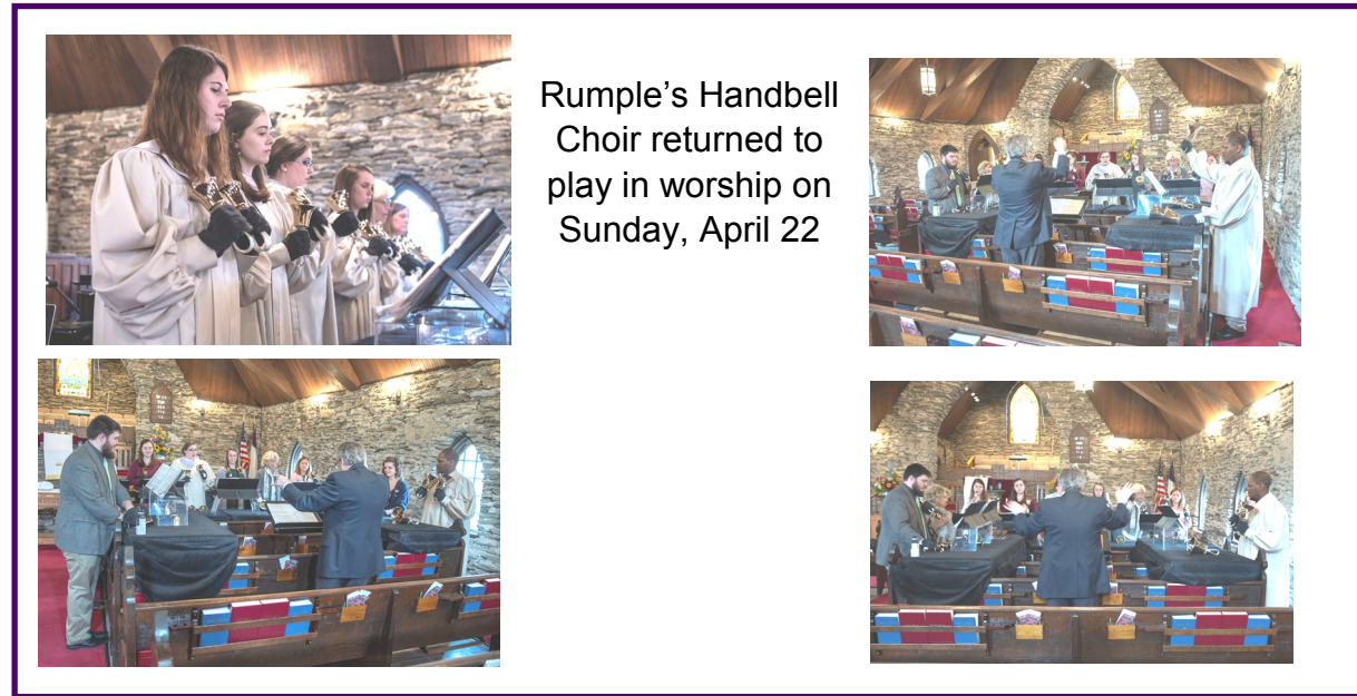
Rumple's Handbell Choir returned to play in worship on Sunday, April 22